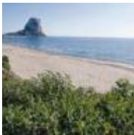
Arenal-Bol Beach [10]