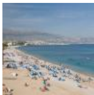
Albir Beach [3]