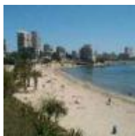
Albufereta Beach [5]