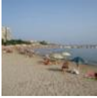
Almadraba beach [7]

This is a small rocky beach with dark sand and calm waters. It nestles between Albufereta beach and Cabo de las Huertas.