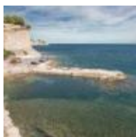
Advocat Cove [1]

Enjoy a nice walk along the beaches of Alicante and then try one of the refreshing ice creams that the local shops in the area put at your fingertips. Certainly, an experience full of sensations and unforgettable moments that you shouldn't miss!