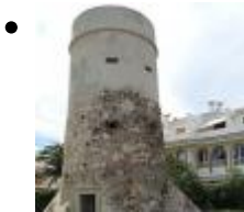
Torre Almadraba [9]

This tower formed a part of vigilance and defence network of the population, protecting from possible attacks by pirates. It is a masonry watchtower with a conical body that has been recently restored.