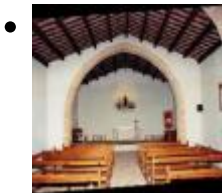
Hermitage of Santa Paula [6]

The hermitage of Santa Paula is one of the hermitages of the Conquest, it receives a pilgrimage celebrated on the 26th of January, date on which the temple opens its doors.