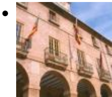
Dénia Town Hall [10]