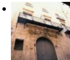
Archivo histórico municipal (Palacio Maissonave) [3]

(gb) La nobleza local levantó en la capital alicantina unos palacios que hoy se alzan como verdaderos monumentos. El de Berenguer de Marquina es el más antiguo y el de Maissonave, construido en el siglo XVIII es hoy la sede del Archivo Municipal que