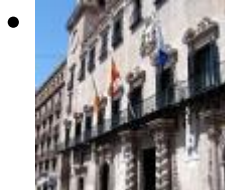
Casa Consistorial [1]