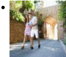
Les Roques Neighbourhood [12]

The XIX century neighbourhood was the former Arabic village.