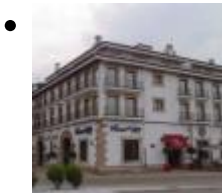
Port Stores (Former Dockyards) [7]

The building is unregistered, since the development of trade, of the original design (for