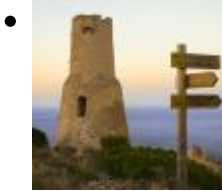
Torre del Gerro [8]

Its privileged position allowed the control of almost the whole of the Gulf of Valencia. Its peculiarity rests in the division presented in its central body, it also possesses a Coat of Arms.