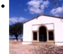
Hermitage of San Juan [11]

In an exceptional location, the white hermitage of San Juan forms part of the some called ?Hermitages of the Conquest?, which were built after the Christian re-conquest of the area.