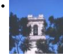
Church of the Asunción [4]

The temple belongs to the moderate baroque period, but was reconstructed after 1939, in order to repair damages caused in the civil war. A current restoration has brought to light some interesting frescoes.